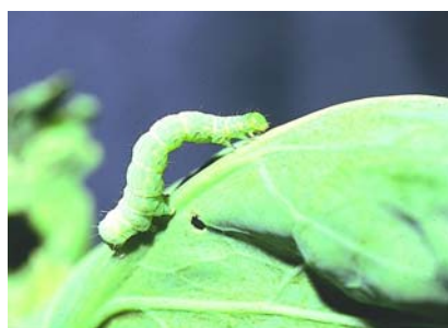
Figure 8. Cabbage looper