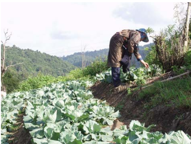
Figure 14. Looking for insect pests and natural enemies

“Resistance management” is especially a concern when Bt is used for diamondback moth control. Perhaps the best way to avoid resistance is to avoid continuous Bt applications and to use the product only when necessary. This requires frequent observations or scouting in the field and the use of treatment thresholds whenever possible. Early detection of infestations is especially important when Bt is used as the primary pest control tool.