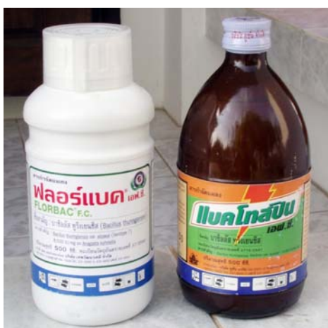
Figure 13. Two types of Bt commonly found in Thailand: trade names Florbac (Bt aizawai ) and Bactospeine (Bt kurstaki ).

The two types of Bt are sold under various trade names (Table 3). The two subspecies contain different toxic crystal proteins (delta-endotoxins or “Cry” toxins) (see Table 1 and Figure 1). These toxins differ in their effectiveness against different pests. In addition, crystal proteins from both Bt kurstaki and Bt aizawai have been combined in some newer products to increase their effectiveness. Table 1 lists the different crystal toxins found in two common Bt kurstaki and Bt aizawai products: