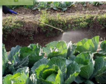
Both upper and lower cabbage leaf surfaces are sprayed with fine mist of Bt when actively feeding caterpillars are present. Caterpillars feed on Bt-coated leaves.

Thousands of strains of Bt bacteria exist and a few of these have been used to manufacture what have been termed microbial or biological insecticides. Most of these commercial products contain crystal-shaped proteins and living spores (Figure 1) from Bt bacteria. There are many commercial brands of Bt; two Bt subspecies are commonly used against caterpillars which feed on cabbage and other vegetable crops.