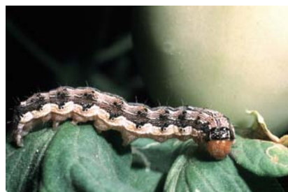
Figure 10. Tomato fruitworm