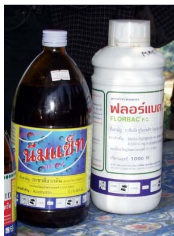
Figure 16. Bt and neem products can be alternated to reduce diamondback moth’s development of resistance to Bt.

For conventional vegetable growers, Bt can be rotated with many other classes of insecticides although some of the benefits of Bt (conservation of natural enemies) could be lost. Newer, “reduced risk” insecticides should be used whenever possible. Pyrethroid insecticides should be avoided.