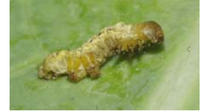
Figure 3. Dead larvae often become shriveled