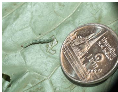
Figure 18. Spray when larvae are small (cabbage looper)

Increased rates of Bt may be required when the crop foliage increases and/or when high caterpillar populations or older caterpillars are present. If possible, Bt applications should be timed with egg laying (20% hatch) of the target pest. If that is not possible, Bt must be used when insect larvae are small and before economic thresholds are reached. Obviously this requires regular field scouting. Knowing the population dynamics of the target pest is essential to any IPM program and is especially important for good control with Bt. When obvious insect damage is visible, it may be a bit late for effective control with Bt at the lowest rates. In the absence of scouting or if overlapping generations or mixed insect pest species are present, regular calendar-timed applications may be the only effective control strategy.