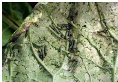
Figure 11. Cluster caterpillars ( Spodoptera litura )