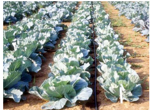
Figure 21. Using drip irrigation instead of sprinkler or hand watering will help Bt products last longer and be more effective.

Irrigation method: Sprinkler irrigation or hand watering can wash off Bt. Drip or furrow irrigation will enhance pest control with Bt by reducing washing off of the product.