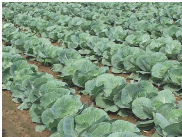
Figure 15. Early “cupping” stage of cabbage growth

* Percentage of plants that have one or more larvae of diamondback moth, cabbage looper, or imported cabbageworm; treat when the percentage of plants infested reaches or exceeds this number.