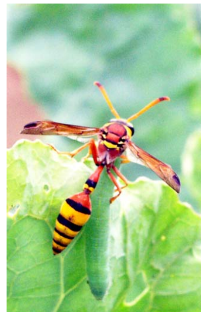
Figure 5. Vespine wasp (predator) carrying imported cabbage worm.

When used as part of an integrated pest management program, Bt also protects natural enemies that can enhance natural control of important pests in addition to the target pest(s). When Bt was used to control armyworms on tomatoes, for example, Liriomyza leafminers then became much less of a problem. In this case, Bt allowed natural enemies of leafminers to survive and help control the pest, reducing the need for other insecticide applications.