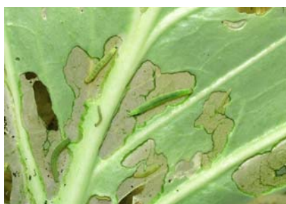
Figure 7. Diamondback moth

Many commercial formulations of Bt kurstaki and Bt aizawai are available for use on vegetable crops; the only reliable way of identifying the most effective Bt product for the target pest(s) is through local field trials. General differences between Bt kurstaki and Bt aizawai products are discussed on the following page: