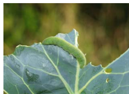
Figure 9. Imported cabbageworm