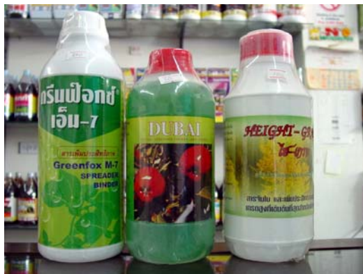
Figure 20. Mix Bt with a spreader/sticker

Use of sticker: Since Bt products are not completely soluble, the use of a sticker or “spreader-sticker” is recommended on hard-to-wet crops such as cabbage. If heavy rainfall occurs within 24 – 48 hours after application, it is recommended to re-apply Bt.