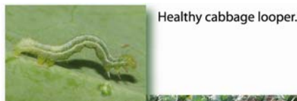
Healthy cabbage looper.

"Bt", first discovered in Japan in 1901, refers to a spore-forming bacterium, Bacillus thuringiensis , which occurs naturally in soils. Some leaf-feeding caterpillars (larvae of butterflies and moths) are killed when they eat very small amounts of leaves or other plant parts that have been coated (sprayed) with Bt.