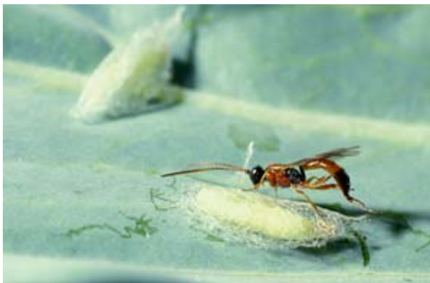
Figure 4. Diadromus collaris , a pupal parasitoid of diamondback moth.

Natural enemies (predators and parasitoids) of insect pests are protected and help control these pests. Several species of parasitic wasps (especially Diadegma spp.) contribute significantly to the natural control of diamondback moth (DBM); DBM control becomes much more difficult when these parasitoids are eliminated by harsh insecticides.