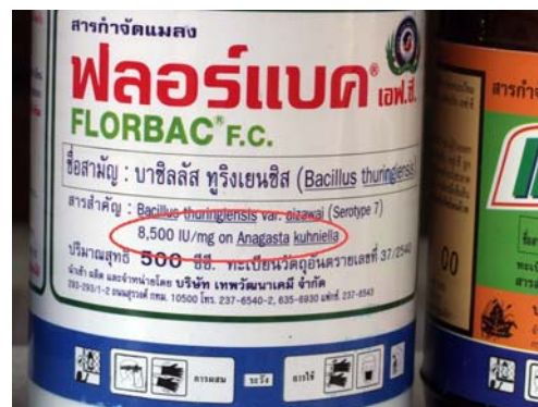
Figure 17. Label close-up (with potency circled in red).

Manufacturers often provide potency data for their products; these data are usually reported in terms of International Units per milligram (IU/mg) or billions of International Units per kilogram (BIU/kg). This is often a source of confusion for trainers, advisors and growers. Potency is a measure of the number of effective killing units of the product (crystal proteins, spores, etc.) in bioassays against cabbage loopers compared to the killing power of a Bt reference strain which is assigned an arbitrary potency value. This generally means that the higher the potency number, the more concentrated the product.