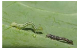
Figure 2. Larvae killed by Bt may become discolored or turn black (larva on right).

be killed. When enough Bt is consumed, toxins in the crystal proteins paralyze the caterpillar's mouth and gut (Figure 1). Pests begin to move slowly and stop feeding within minutes to an hour after consuming a sufficient dose. The toxins break down the insects' gut wall within hours, allowing Bt spores and the insects' normal gut contents to invade the body cavity. This causes death by starvation, septicemia (blood poisoning), and/or osmotic shock within 24-48 hours. Some larvae killed by Bt may become discolored or turn black; dead larvae often become shriveled (Figures 2-3) and fall from the plant where they are not easily observed by farmers or IPM scouts.