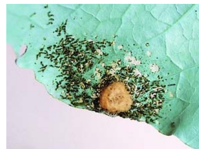
Figure 12. Egg mass and group of 1st instar larvae of cluster caterpillar.